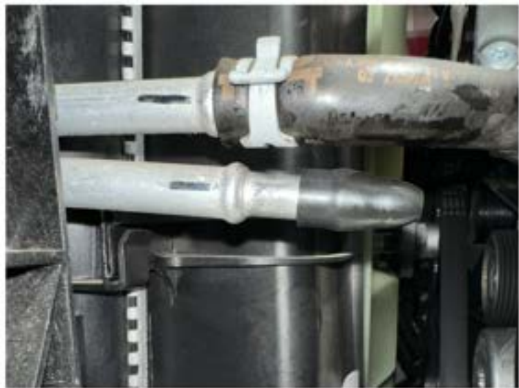
Quickly install supplied rubber line cap to cooler port to stop power steering fluid from draining.