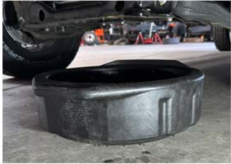
Place oil pan under van and below funnel end.