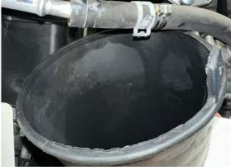
Place funnel below power steering hose and through van subframe.