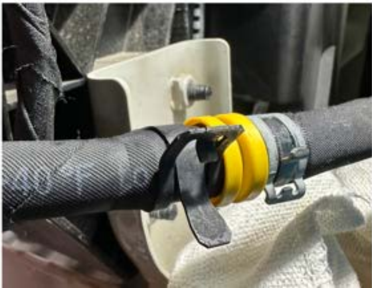
Install the new AO hose with barb fitting end onto the factory power steering hose as shown. Use clamp pliers to position the factory and the supplied band hose clamps as shown.