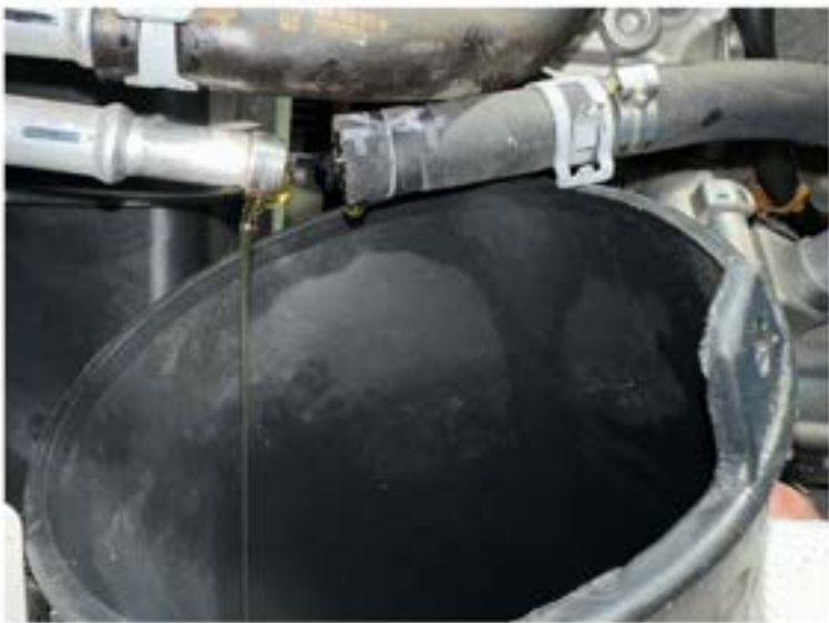
Pull power steering hose from cooler port.